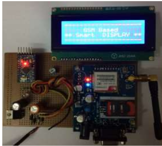
Figure 2: GSM Based wireless Notice Board